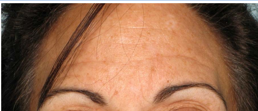
Before (top) and 3 months After (bottom) Dysport treatment.

Dysport dosage will depend on the area to be treated, as well as the size and the uses of the muscles causing the individual's lines. Standard dosage is usually about 500 units; however, this value is customizable to the patient's needs. For treatment of glabellar lines the physician must give 50 units intramuscularly in 5 equal aliquots of 10 units each. Physicians should note that Dysport should be administered no more frequently than every