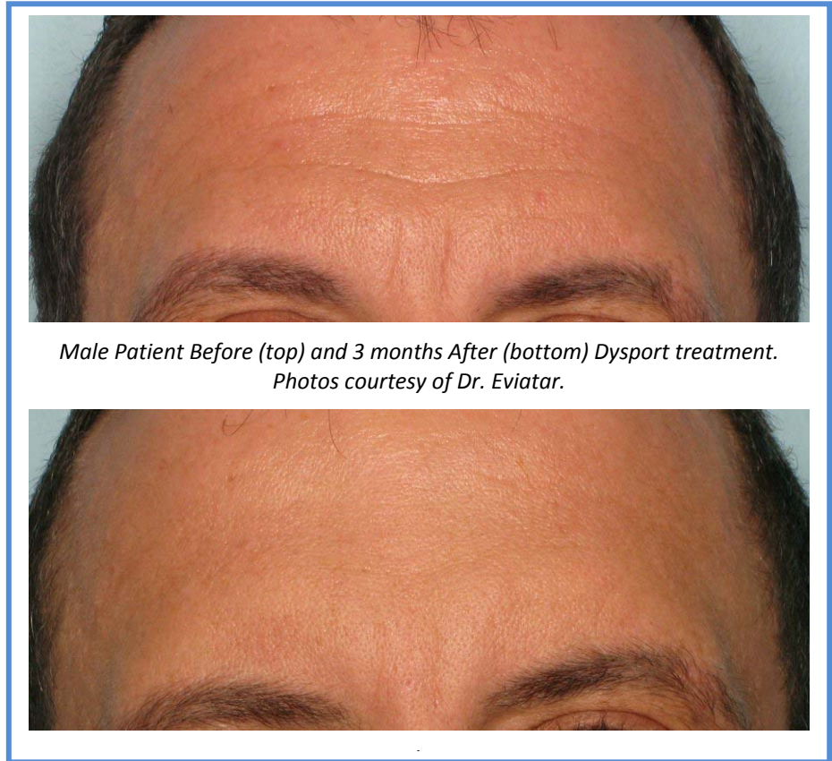
Male Patient Before (top) and 3 months After (bottom) Dysport treatment.